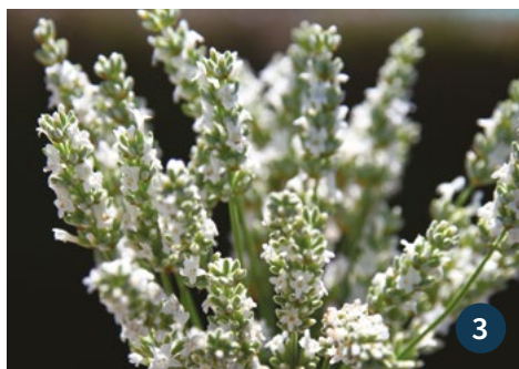
Lavandula x intermedia EXCEPTIONAL ('HILLAV')