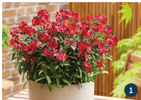
Erysimum COLOUR VIBE RED ('CDCERY01')

Providing enhanced sensory benefits, satisfying gardeners' needs for curiosity, novelty and discovery – part of our recipe for life.