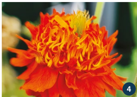
Geum 'Orange Pumpkin'