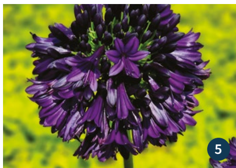
Agapanthus BLACK JACK ('DWAghyb02')